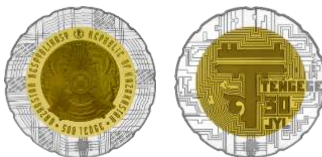
Image of the coin with a face value of 500 tenge

More detailed information for the representative of mass media is available upon request: